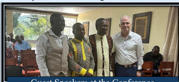
Guest Speakers at the Conference