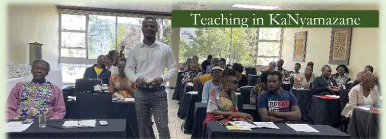
Teaching in KaNyamazane