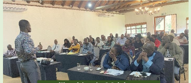
Teaching in Malelane