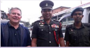
Major Tom, Colonel & Captain