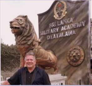
Sri Lanka Military Academy